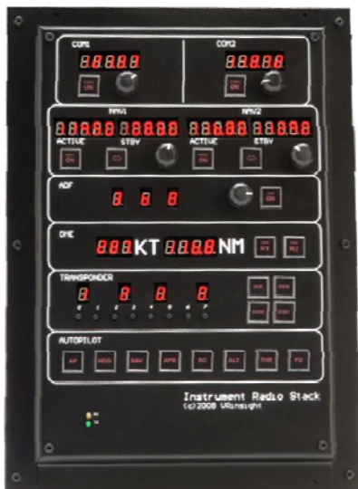
Instrument RadioStack after attaching Keyskin