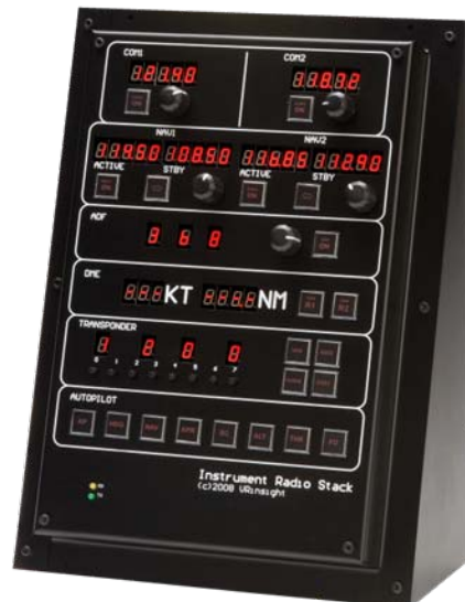
Instrument RadioStack with rack